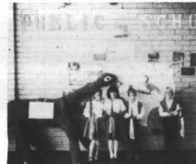
ELPS Public School Week